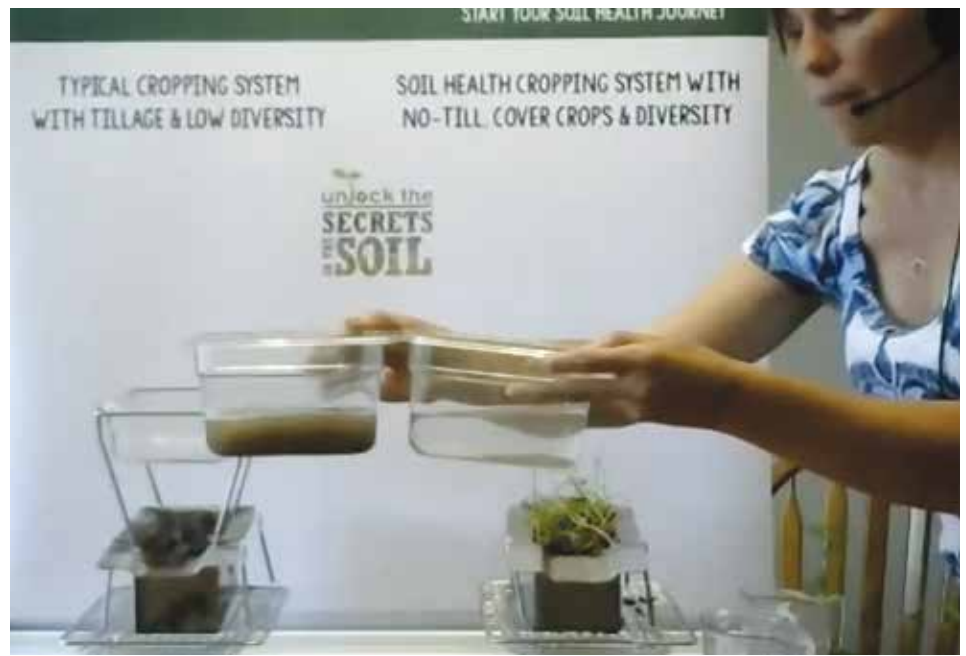
A soil health workshop held remotely via Zoom.

While online offerings are an important way to continue farmer education and networking when in-person meetings are impossible, and while they may provide access for some people who could not attend in-person gatherings, they may remain beyond the reach of underserved audiences for whom information, skill development and networking could have critical impact. While our work here does not contend with these issues explicitly, we feel it's important that they guide the way we think about putting on online events, particularly because mainstream agricultural and ranching spaces (and resources) are typically