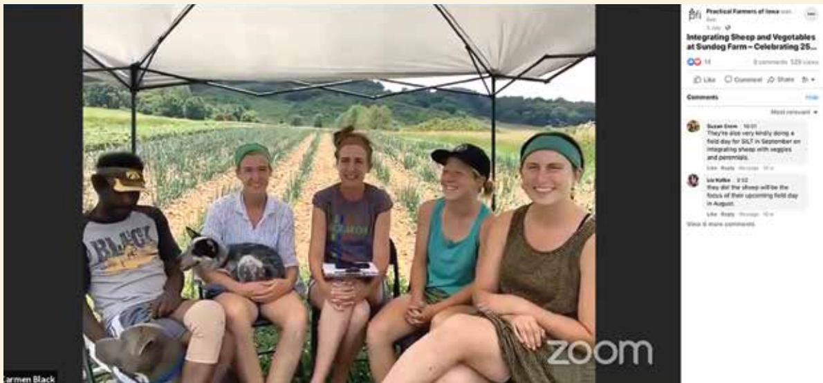
A virtual field day held on Zoom.

Everyone on staff and all our farmer speakers have stepped up and adapted, and we were able to provide flexibility within our formats to accommodate the vision of our staff and speakers. There is a core team of about seven people that contributes to various dimensions of the inner workings of our virtual field day season. We've become a well-oiled machine, and when something changes requiring action from the team, it's fun to see everyone's names pop up in comments responding to their specific niche. I think I find that aspect of teamwork even more energizing now that we are working apart from one another. Knowing that my coworkers are simultaneously working on the same thing is nice—we're together in a sense.