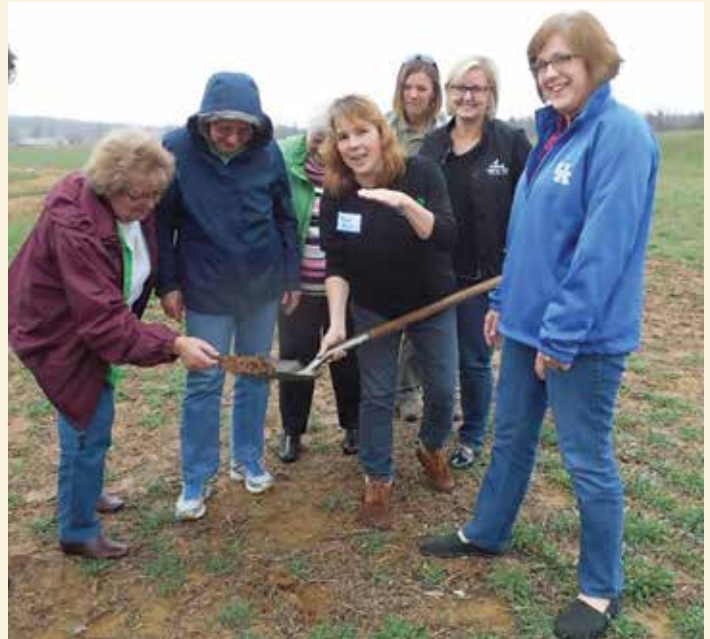
A WFAN Women Caring for the Land event held in Kentucky pre-COVID.

resources (though these still did not meet the quality of in-person networking).