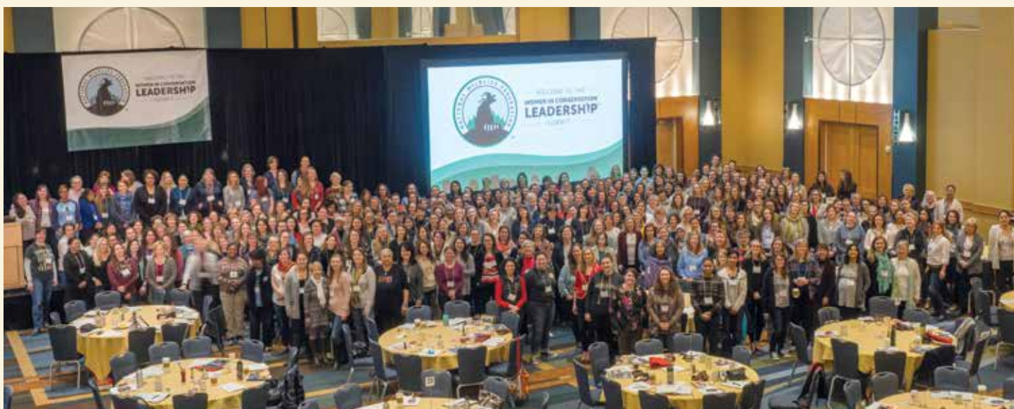
Attendees at a pre-COVID Women in Conservation Leadership conference.