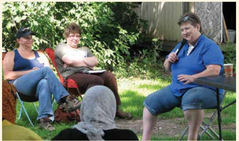
A pre-COVID event for women farmers on the subject of cover crops, hosted by MOSES.

These will be increasingly important questions to address in the future related to virtual event outcomes. We had higher participation of educator/agency women than what is typical at our events. Additionally, we did have a handful of male attendees. (That would not have been typical of our in-person events.)