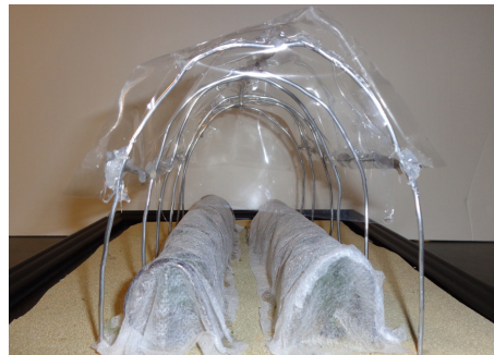
Figure 4. Row covers or fine insect screens installed over low-hoops can provide additional crop protection from small insect pests when installed early in the season.

In this way, both producers use multiple IPM strategies for full benefit to their small farms. A third on-farm test site is under construction in Alabama to test 40 percent shade cloth in the open field.