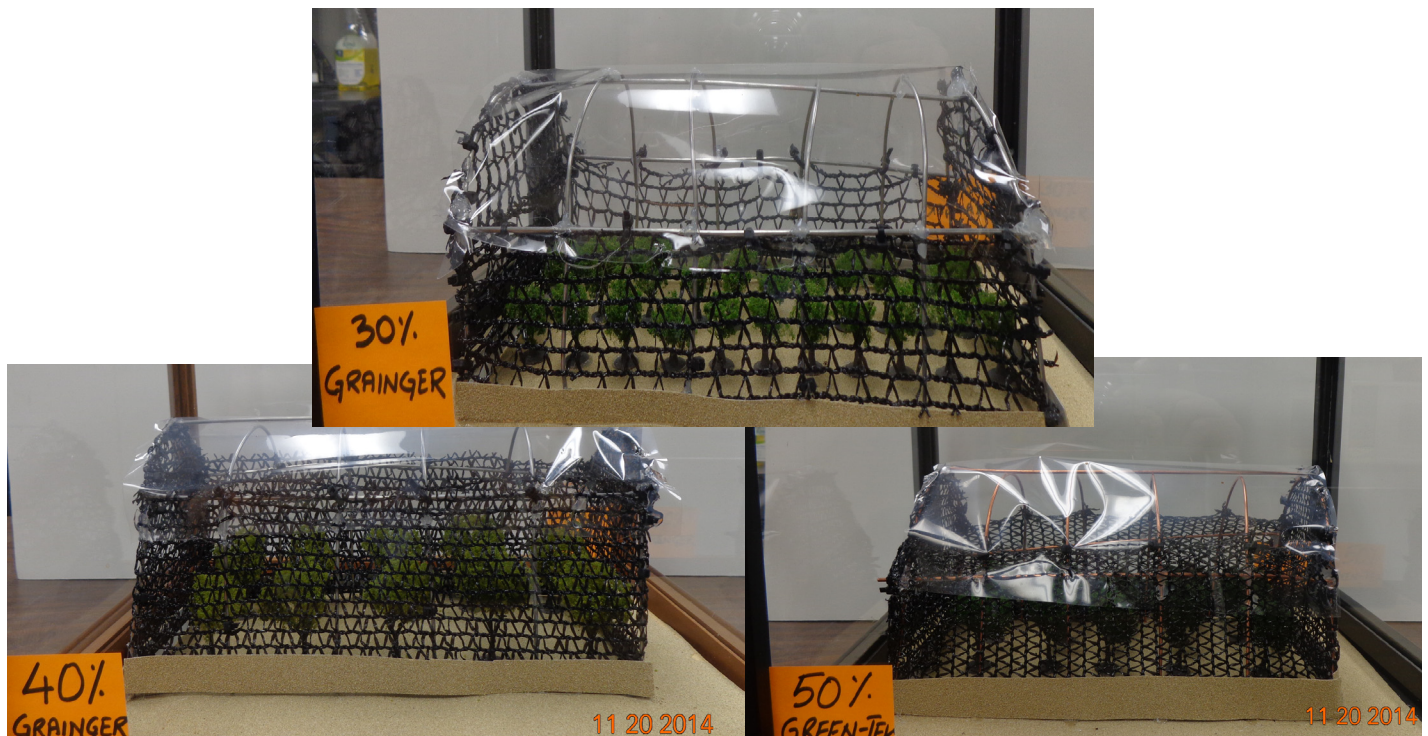
Figure 2: High tunnel models with 30 percent to 50 percent shade cloths on the sidewalls and endwalls for rapid insect behavior studies.

Green lacewings, a popular beneficial insect of choice among organic producers, can be excluded with 40 or 50 percent shade cloth on the side-walls. Adult lacewings, with their large net-like wings, are not able to penetrate those barriers.